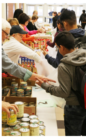
Students at Northeast High School receiving food during the Food Market