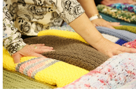
These prayer shawls are being blessed by the volunteers that knitted or crocheted them. Prayer shawls are then distributed by Care Team members or Pastors to those battling an illness, on hospice, or experiencing a difficult time.

made to parents of newborns and those hospitalized. Care Team members also facilitate Renewed Hope and Divorce Care. Currently there are over 50 Care Team members serving in various ways.