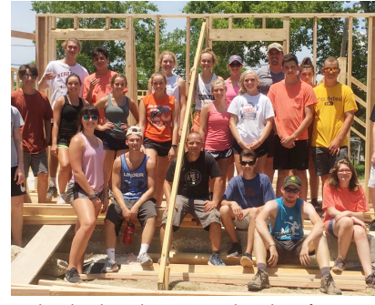
High School Youth serving with Habitat for Humanity in Galveston, TX.

▶ High School Peer Ministry—a new leadership opportunity for high school youth was formed for students to learn how to lead and minister to their peers within youth group and in their lives at large. Our