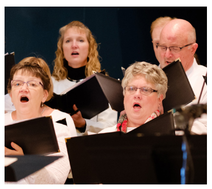
Mixed Choir members singing for worship.

At Southwood, we believe that worship is central to our life as a Christ follower. In worship we center our praise on God and this reminds us that God is at the center of our whole life!