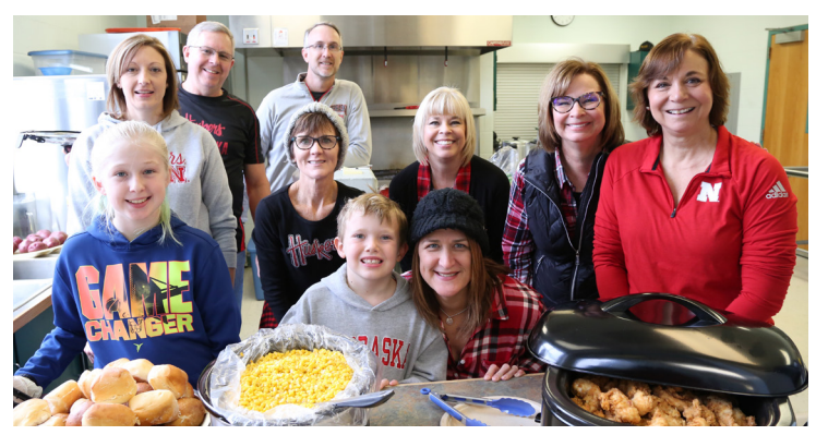
Volunteers serving food to kids at the F Street Rec Center on Saturday. These children often don't know where their next meal comes from without their school breakfast or lunch.

Volunteers strive to be the connecting body of Christ, creating healthier communities locally and in Honduras/Tanzania by providing hope, healing, education and empowerment.