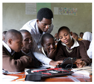
Students at Uroki School using new tablets through Opportunity Education to enhance their learning experience.

learning. This program launched with first-year students and Southwood has committed to advance it to the next year as they progress through school.