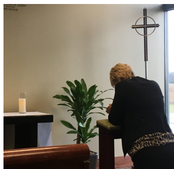
The Prayer Room and Prayer Chain provide daily opportunities to go to God in prayer.

► Grief Support was an emphasis in 2017. We had 37 funerals, which is an increase from 16 the previous year. Along with coordination of the funeral service and luncheon, follow-up contacts, grief letters, grief groups, an overnight grief retreat, and individual visits, are all ways we provide care as families heal. We also offered support to over 89 other Southwood families who experienced the death of someone significant to them this year in addition to others in the community who seek grief support.