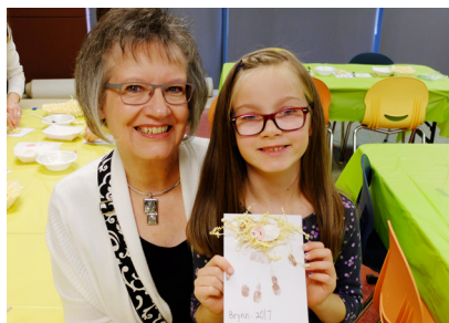
Kids and families made Christmas crafts together at the Advent Festival.

faith together. In early December we held the Advent Festival where families came to celebrate Christ's birth by creating crafts together.