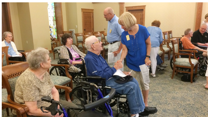
Care Team Worship volunteers greeting residents at a long-term care facility following a worship service.

Cultivating a Culture of Care throughout Southwood was our goal in 2017. We carried this out by making visits, offering classes, providing Care Tips, sending cards and notes, offering Spiritual Support and building intentional, faith-filled relationships.