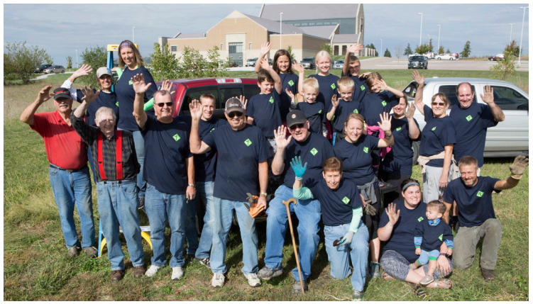
The garden cleaning crew during Southwood Serves. It takes many hands to plant, weed, harvest and clean up a garden that produced 5.75 tons of food.

Quilts for Lutheran World Relief, Honduras, Tanzania and Community Partners