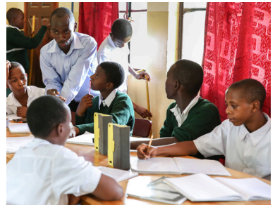
Students in Tanzania using new technology in the classroom.