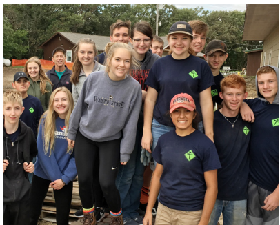
Youth serving at Camp Carol Joy Holling during Southwood Serves.