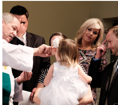
86 children and adults were baptized at Southwood in 2017.

At Southwood, we believe that worship is central to our life as a Christ follower. In worship we center our praise on God and this reminds us that God is at the center of our whole life!