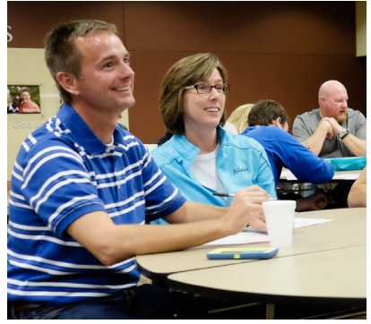
Small Groups gathered several times in 2017—both at church and in homes.

▶ 600 people gathered together to grow their faith in Small Groups and other studies. 800 people subscribed to Daily Devotionals written by 40 writers. Over 400 people attended both Fall Festival and Reformation events.